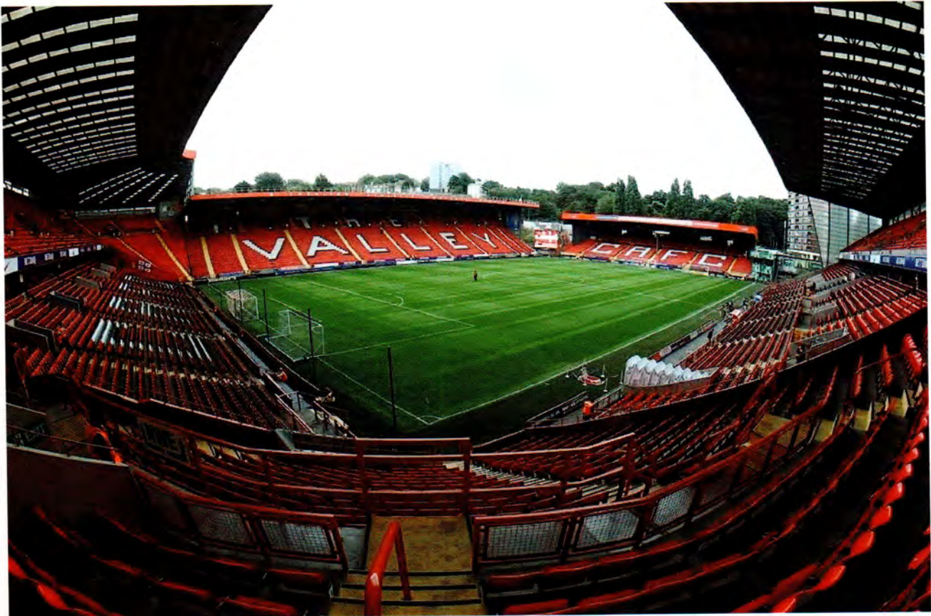
Two businessmen who lied about being "in control" of Charlton Athletic may now have to pay more than £3 million in damages

Like Click to follow The Evening Standard